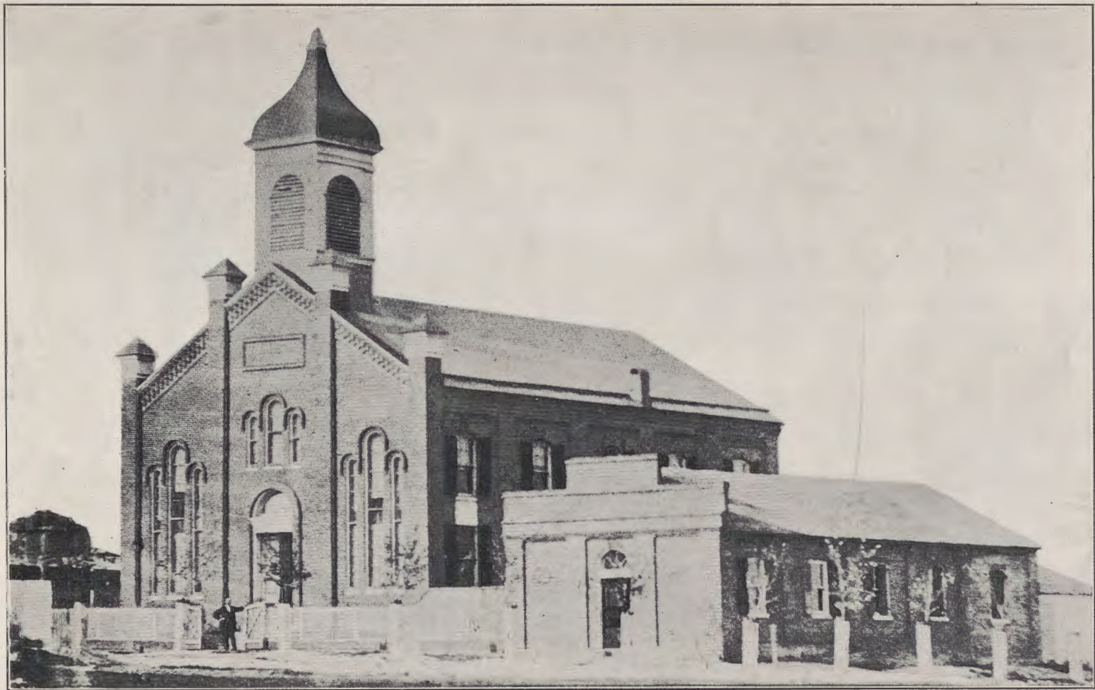
The Church and School Building in 1874