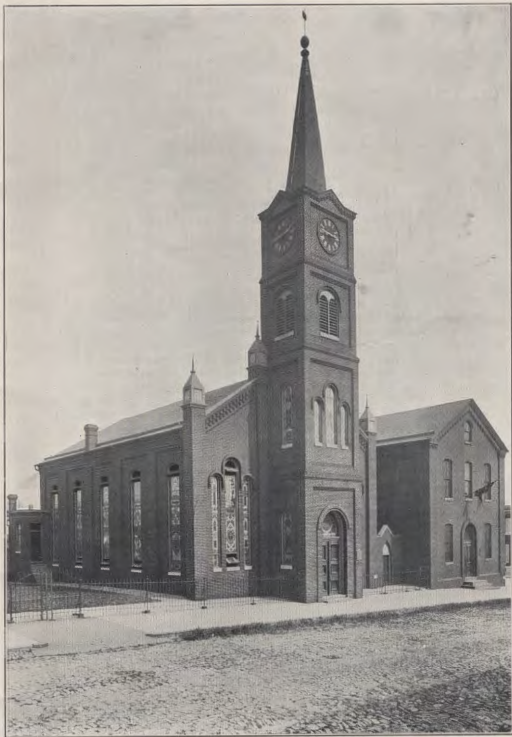
Our Church and Parish Hall