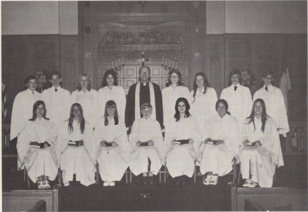
Confirmation Class of 1973