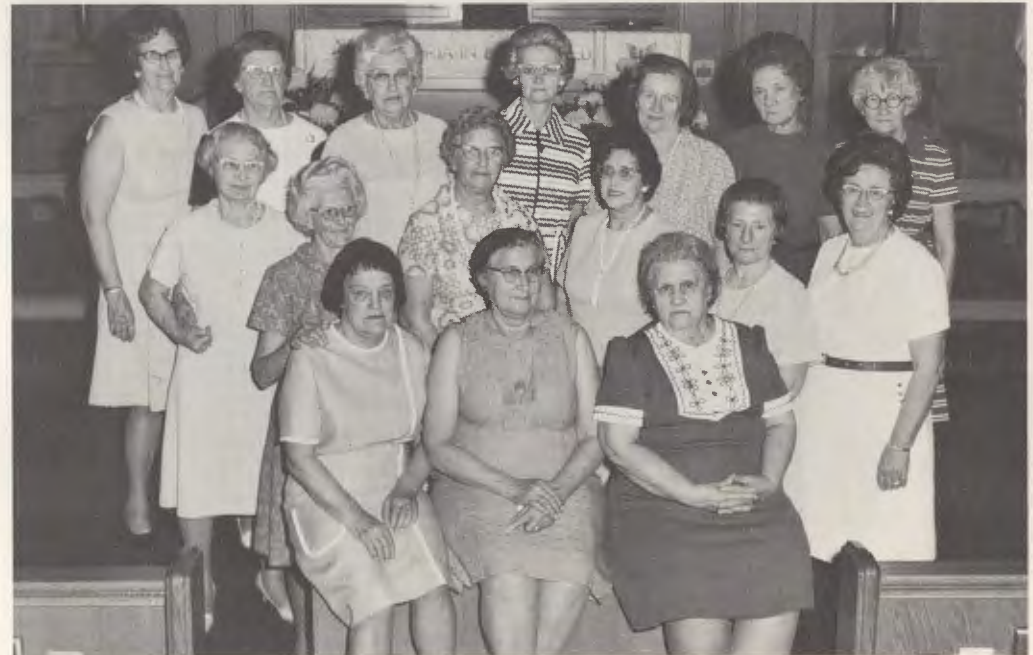
Ladies Sewing Circle

Some of the articles made by this group are bed jackets, gowns and sacks for babies, receiving blankets, footies, towel bibs, dresses, and roll bandages. These articles have been distributed where needed to the American Leprosy Society, the Baltimore City Hospitals, and the Rosewood State Hospital.