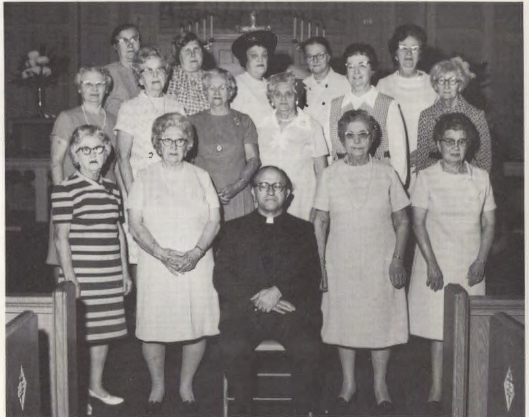
Ladies Aid Society