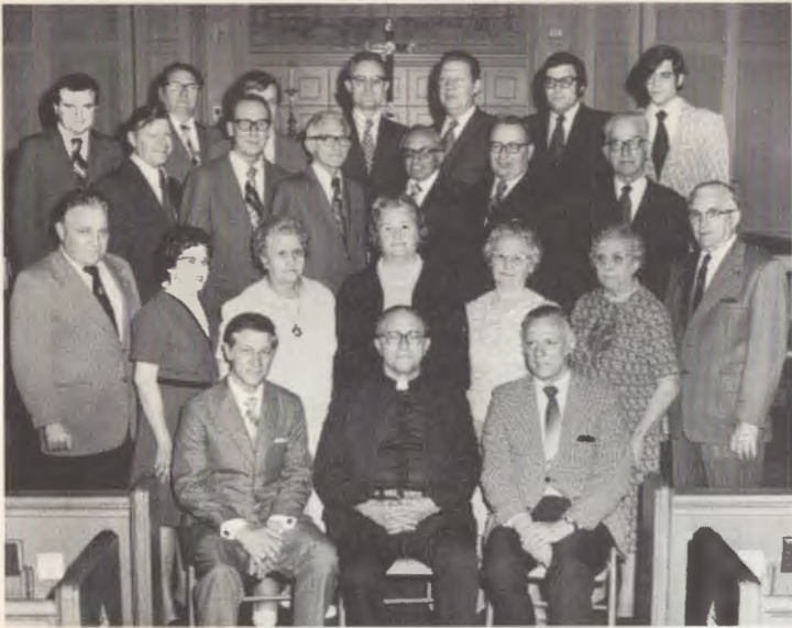
100th Anniversary Committee