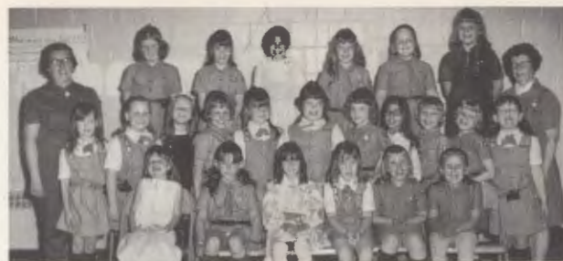
Scouts - Brownies