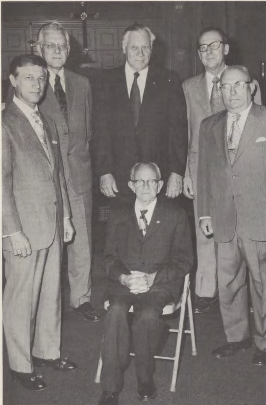
Living Church Council Presidents