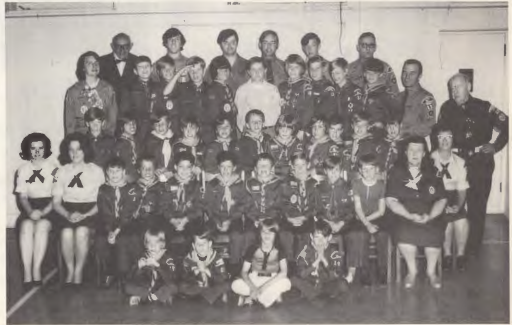
Scouts - Cubs