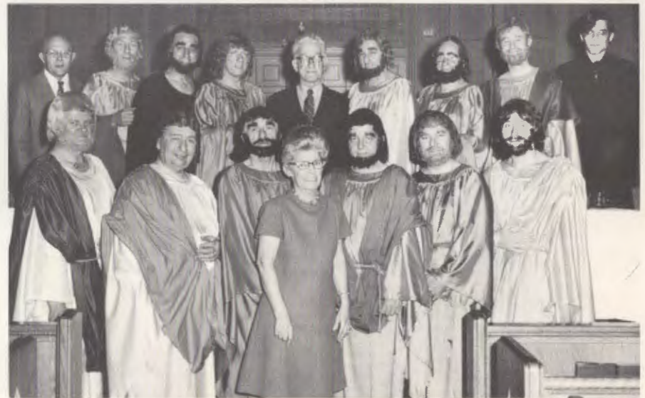
Tableau - Lord's Supper Cast