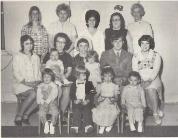
Church Sunday School - Nursery Department