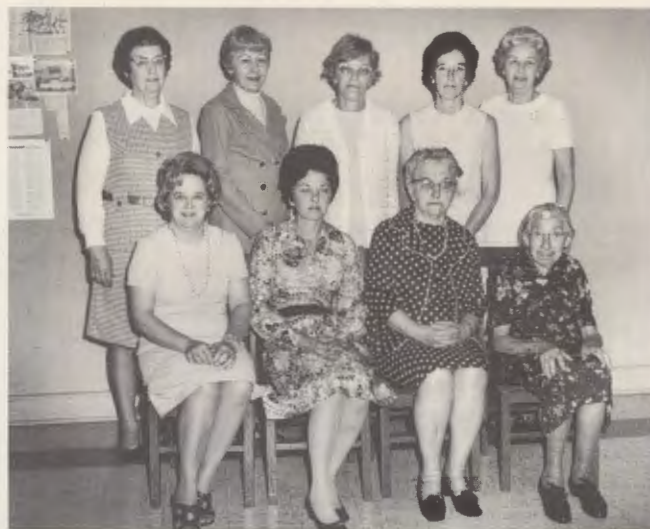
Church Sunday School - Ladies Adult Class