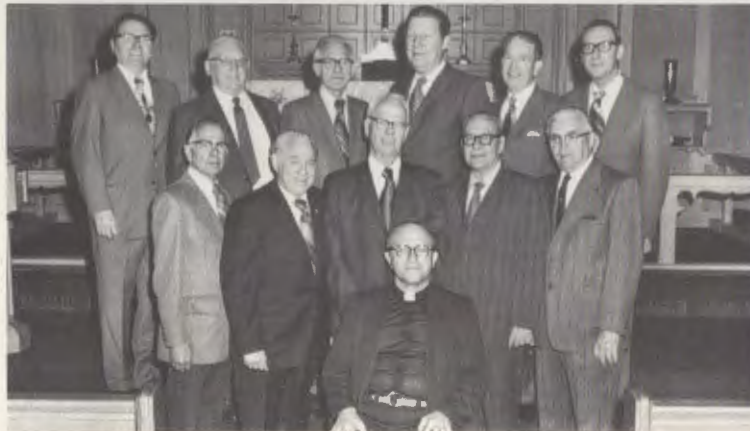
United Men's Fellowship