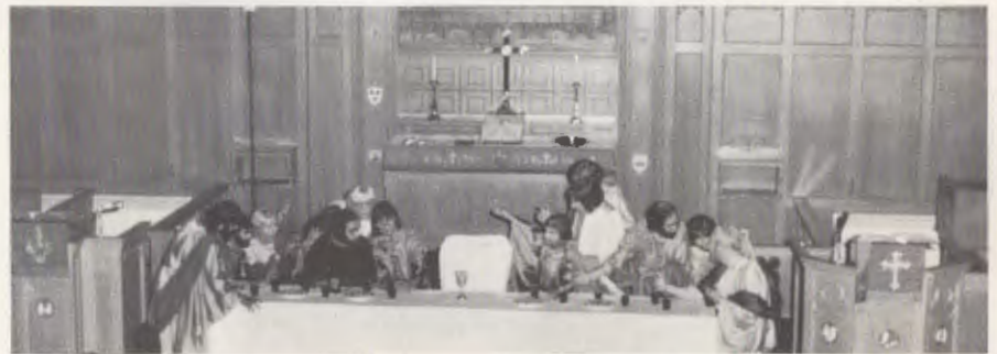
Tableau - Lord's Supper Pose

New robes were purchased in 1971, which help to add to the beauty of the tableau. Ann Witzke takes care of the men's wardrobe, sees that they are properly robed, and at each performance supervises the setting of the chancel and acts as prompter during the performance of the tableau. The beards and wigs are applied by Al Witzke, who also attends to the lighting during the performance.