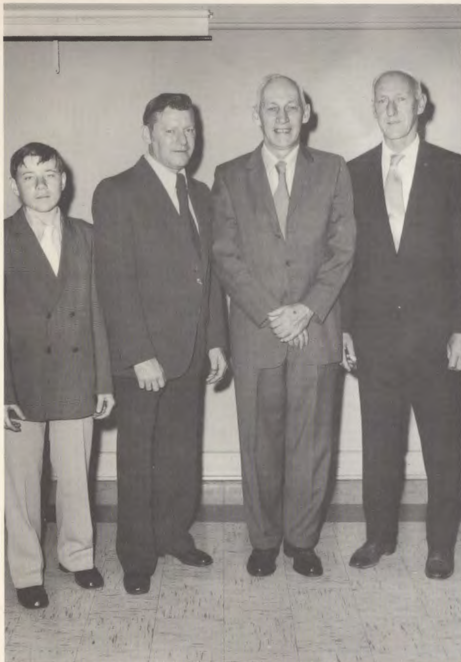
Church Sunday School - Men's Bible Class