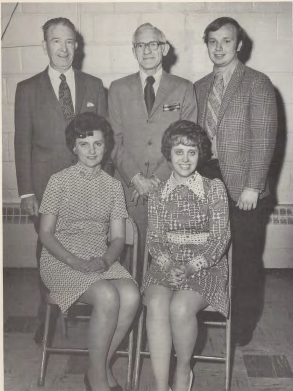
Church Sunday School - Office Staff