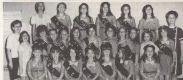
Scouts - Juniors