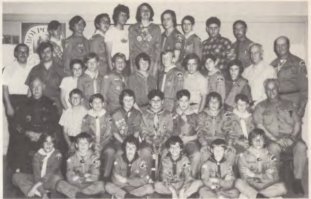
Scouts - Boy Scouts