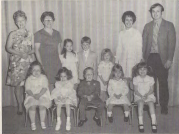
Church Sunday School - Kindergarten Department