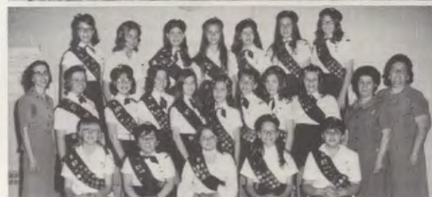
Scouts - Cadets