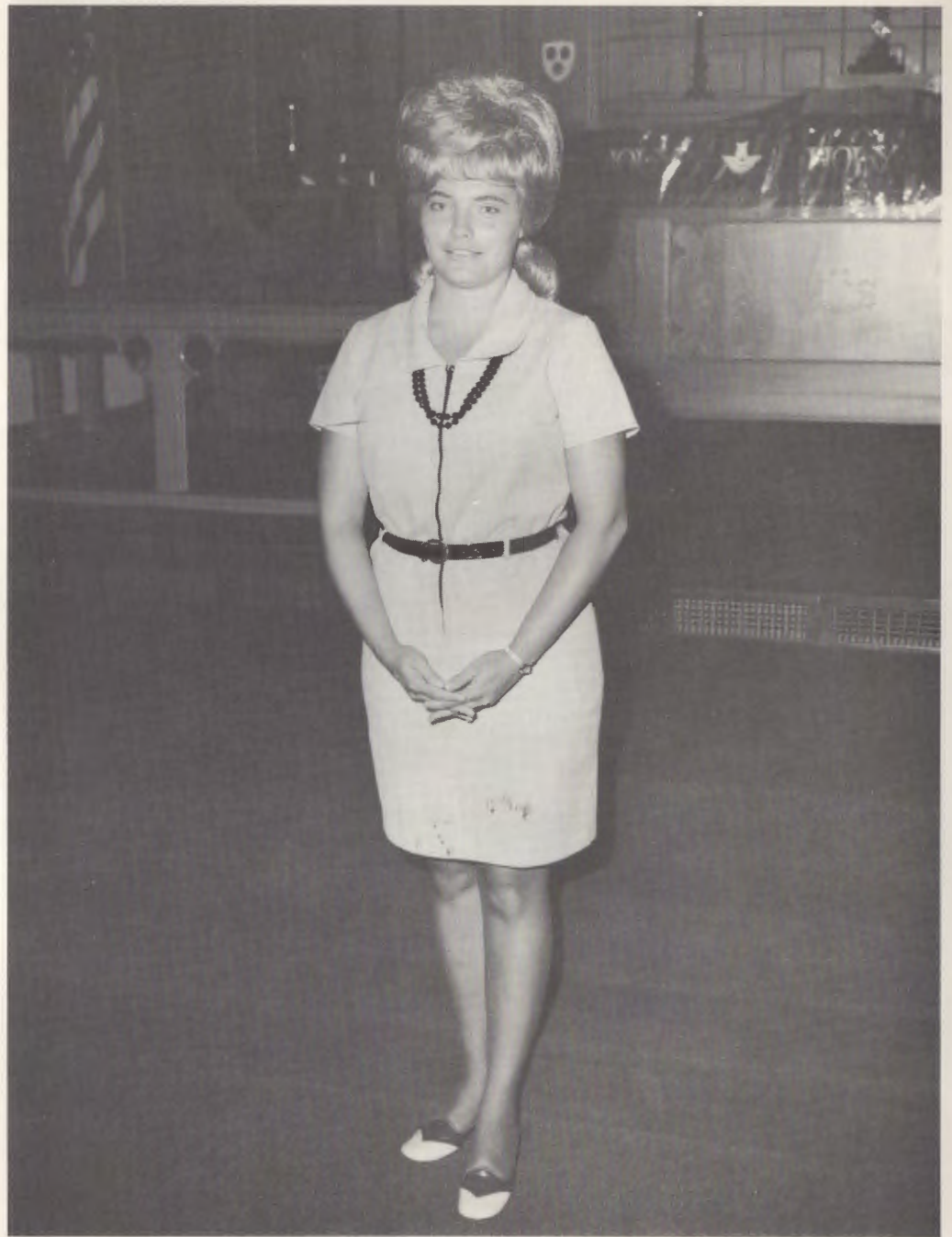
Church Sunday School - Cradle Roll