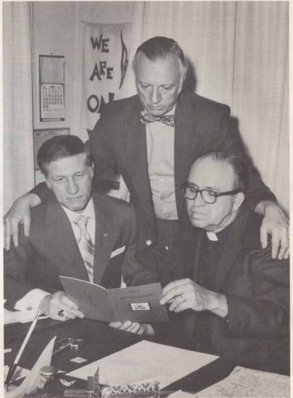
President Church Council Arthur A. Block