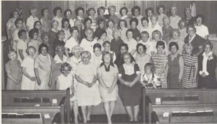
Young Women's Guild