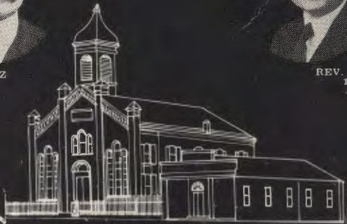
FIRST CHURCH & HALL