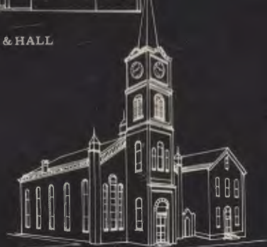
SECOND CHURCH & HALL