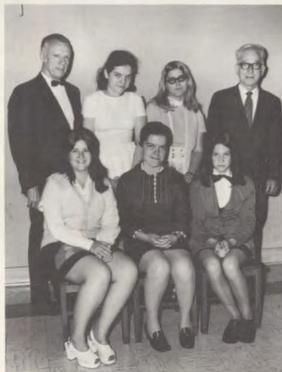
Church Sunday School - Middle & Senior High Department