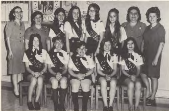
Scouts - Seniors

The first time in 26 years of scouting in United Evangelical Church, we have 12 Cadettes going into Seniors this fall the new Senior troop will be at United E. Church starting this fall. A dinner will be given in their honor for first class the highest the girls can go. Most of these girls have been in scouting since the age of seven.