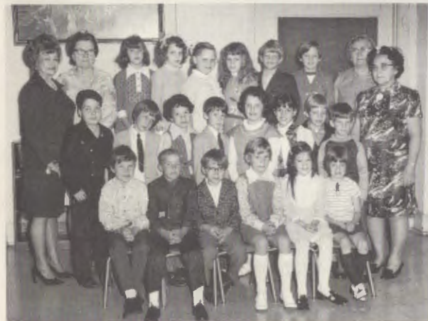
Church Sunday School - Primary Department